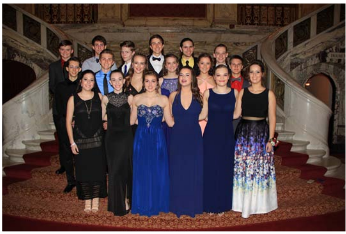
Members of the RRHS Drama Department attend the 2016 Dazzle Awards at Playhouse Square.

The RRHS Drama Department's production of Catch Me If You Can was the winner of the 2016 Dazzle Awards The Connor Family Best Musical.