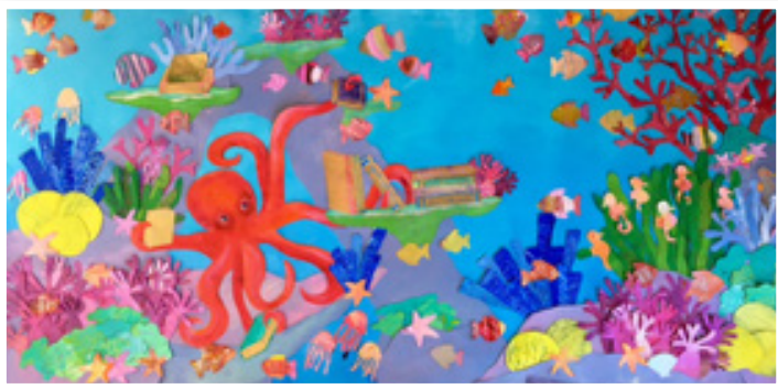
Strength in Numbers

Every year, the fourth grade class at Kensington Intermediate School works cooperatively on an art project. The project gives the students a chance to create an individual piece as well as a group piece. The group project is displayed at the District Art Show and then added to Kensington's permanent collection, where it will hang in the office.